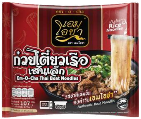
Thai Boat Noodles