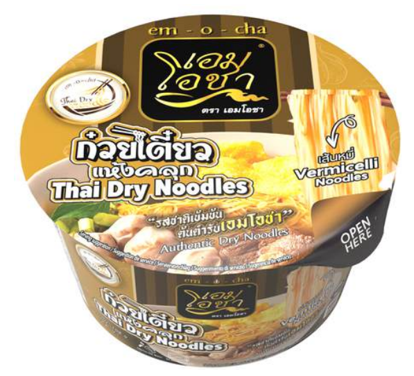
3.60 oz / 102 g

Thai Boat Noodles, also known as "Kuay Teow Reua" are a type of noodle soup that originated in Bangkok's floating markets, as they were originally sold by boat vendors who traveled along Bangkok's canals. Thai Boat Noodles are a vital part of Thai cuisine and culture. It is common to have a quick and satisfying meal on the street in Thailand, which is known for its incredible street food.