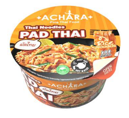
Pad Thai 3.53 oz / 100 g