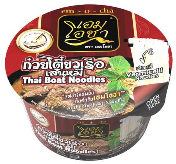
3.77 oz / 107 g