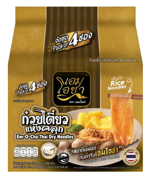
AVAILABLE AS PACK OF FOUR