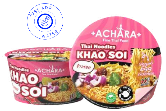
Khao Soi 3.53 oz / 100 g