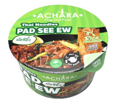
Pad See Ew 3.53 oz / 100 g