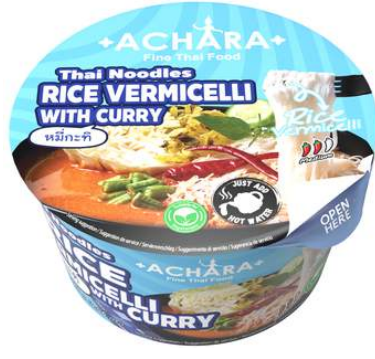
Rice Vermicelli 3.53 oz / 100 g