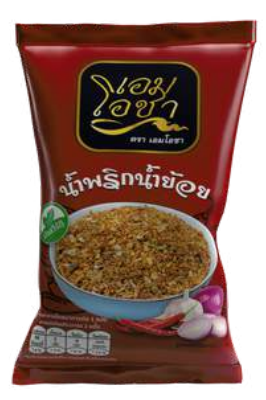
SHALLOTS & CHILI