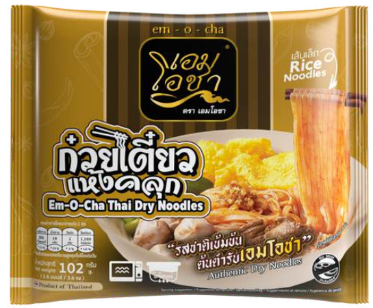
Thai Dry Noodles

Thai Boat Noodles, also known as "Kuay Teow Reua" are a type of noodle soup that originated in Bangkok's floating markets, as they were originally sold by boat vendors who traveled along Bangkok's canals. Thai Boat Noodles are a vital part of Thai cuisine and culture. It is common to have a quick and satisfying meal on the street in Thailand, which is known for its incredible street food.